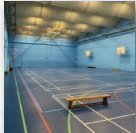
Fully refurbished Sports Hall, ready for students to get active!

Within the last three years we have refurbished our Sports Hall and Art rooms, improved IT provision in the Library, refurbished our theatre, fully re-wired the school, installed 'green' lighting, improved on-site security, rejuvenated classrooms, and have a new Sports Hall roof! Of course, we are never finished - when we complete the school, we'll just start all over again !