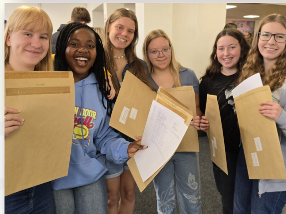
All smiles for Y11s whose hard work paid off come Results Day.