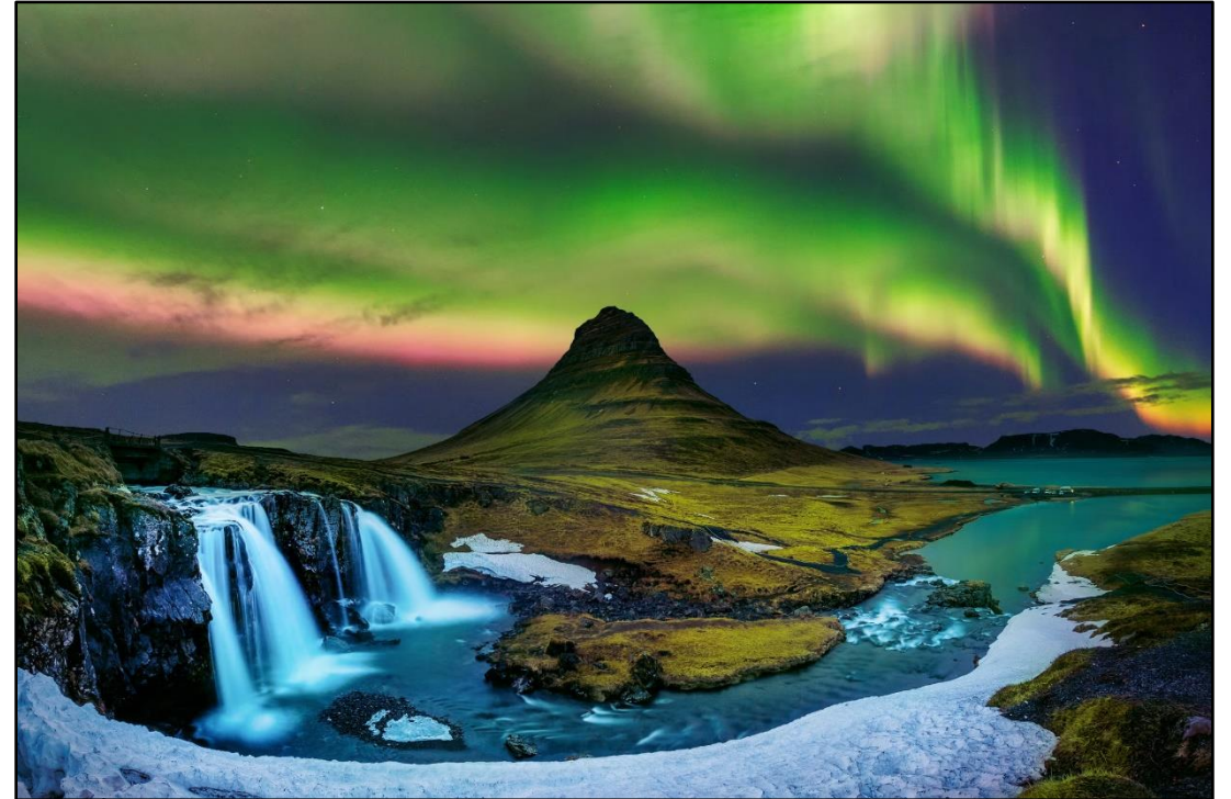
Northern Lights, Iceland

Y10/Y13 - Geography Iceland (£1,000 approx)